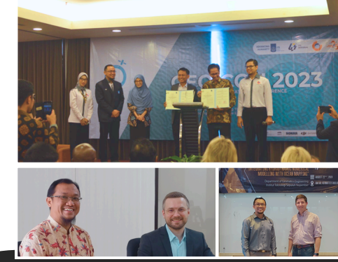
SEMINARS AND GUEST LECTURERS