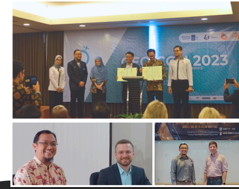
SEMINARS AND GUEST LECTURERS