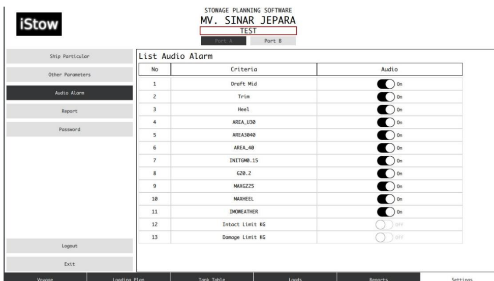
Figure 2. Stability criteria compliance of iStow: audio setting