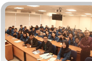
Study Excursion 2019 NTU, Sembcorp Marine Ltd, Thome, Singapore