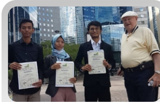
Best Poster Award International Conference of Industrial Engineering & Operations management, France 2018