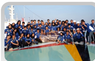
Seatrans Super Sailing, 2019 Balikpapan