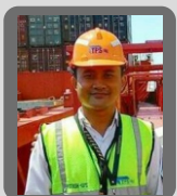
Fitroh A.I. PT. Terminal Petikemas Surabaya