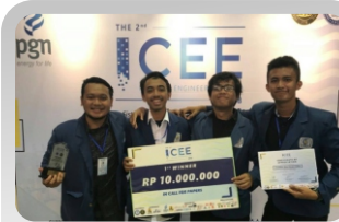
1 st Winner ITB Civil Engineering Expo 2018, ITB Bandung