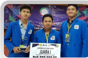
1 st Winner Chemication Energy Competition, 2018 UPN Veteran Surabaya