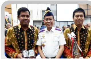
1 st Winner of National Transportation Research Competition, Ministry of Transportation