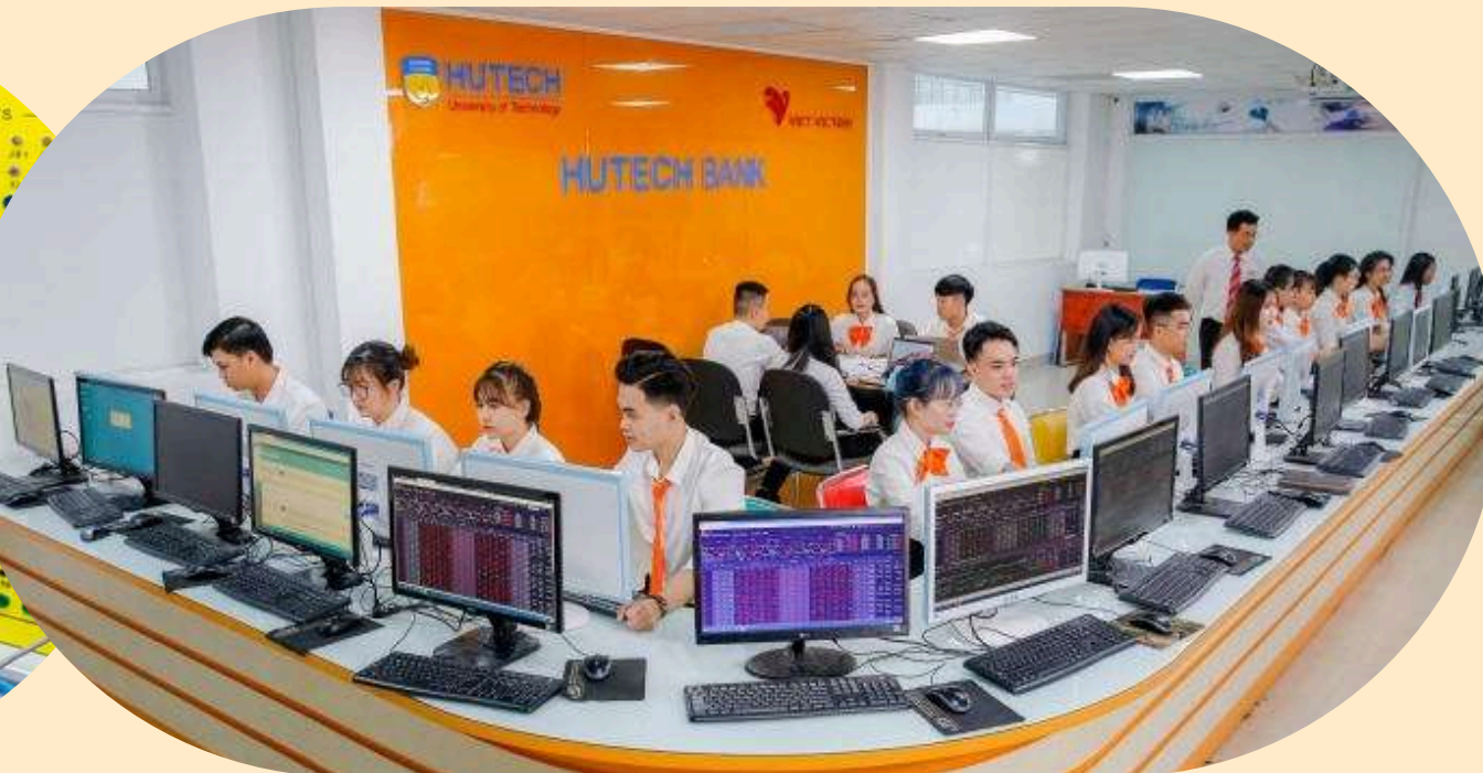
Simulated Learning Environment