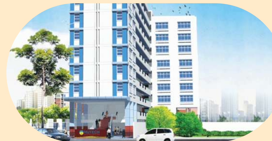
Ung Van Khiem Campus