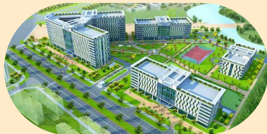
Hitech Park Campus