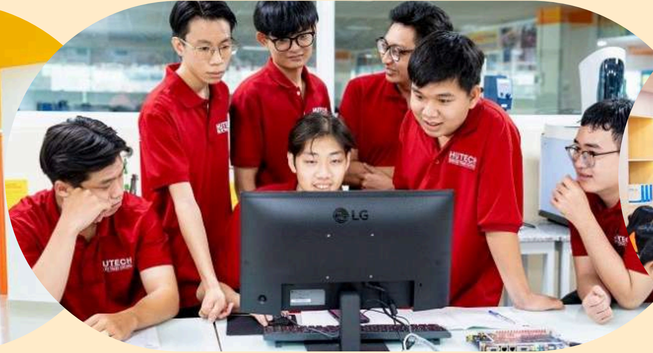
High quality classrooms