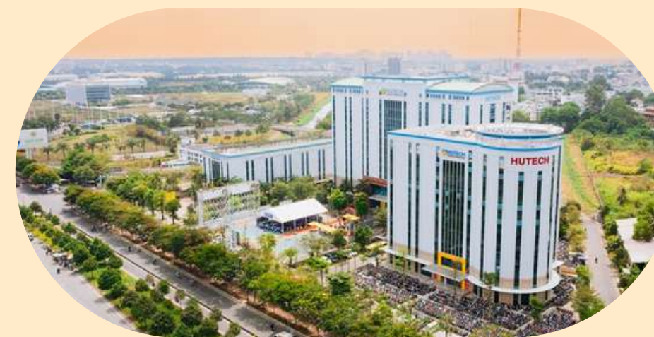
Thu Duc Campus