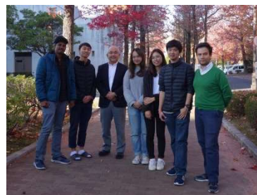
<Graduates in 2021>

The university administration strongly supports his/her application for the job.