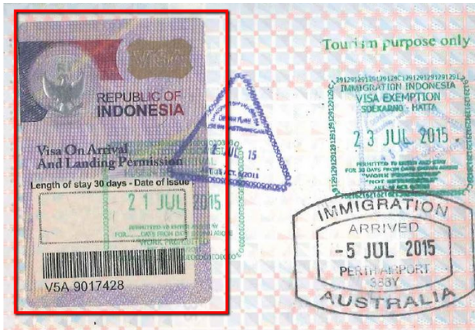
Visa on Arrival (VoA)