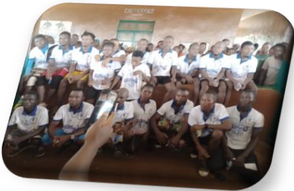
PARTICIPANTS FOR THE MARATHON