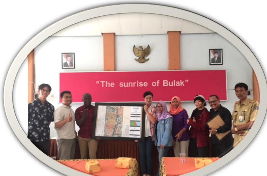
MYSELF AND STUDENTS FROM TAIWAN AND INDONESIA PRESENTING A FINISHED PROJECT PRODUCT TO THE GOVERNMENT AUTHORITIES IN THE BULAK COMMUNITY IN SURABAYA IN 2018