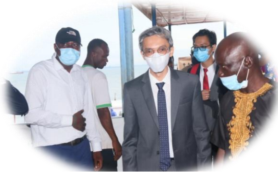
AMBASSADOR WITH KNB STUDENTS