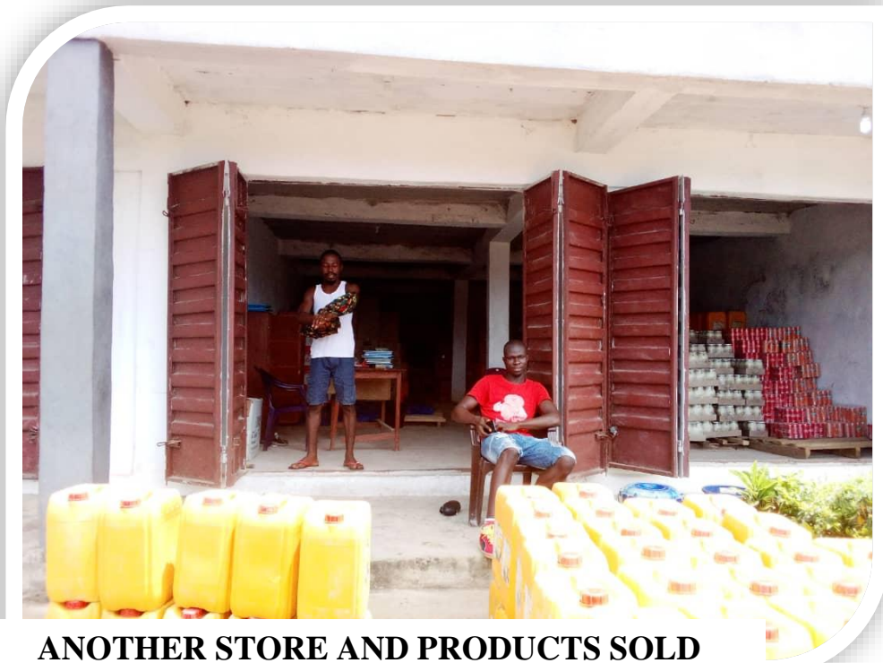
ANOTHER STORE AND PRODUCTS SOLD