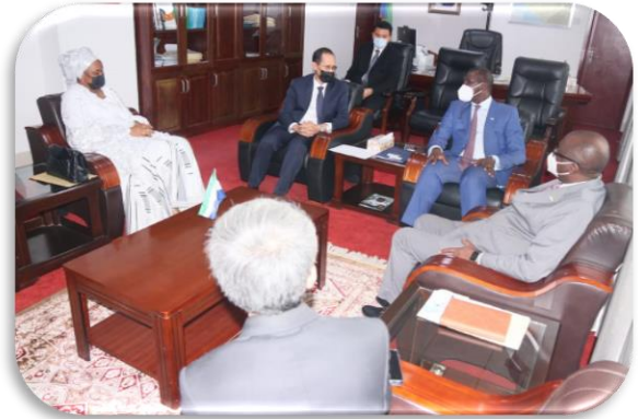
AMBASSADOR WITH GOVT. OFFICIALS