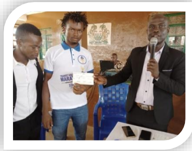
PRICES GIVEN TO THE WINNERS OF THE MARATHON