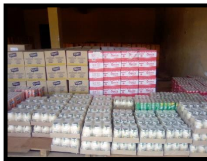
ONE OF THE STORES AND PRODUCTS SOLD