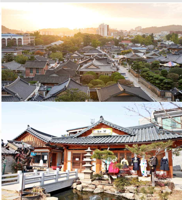
Hanok Village Tour