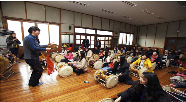
Imsil Philbong village - Traditional Music Experience