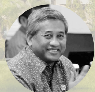
Prof. Muhammad Nuh Minister of Education Indonesia 2009-2014