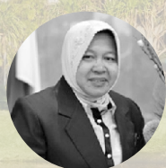
Dr. Tri Rismaharini Surabaya City Mayor