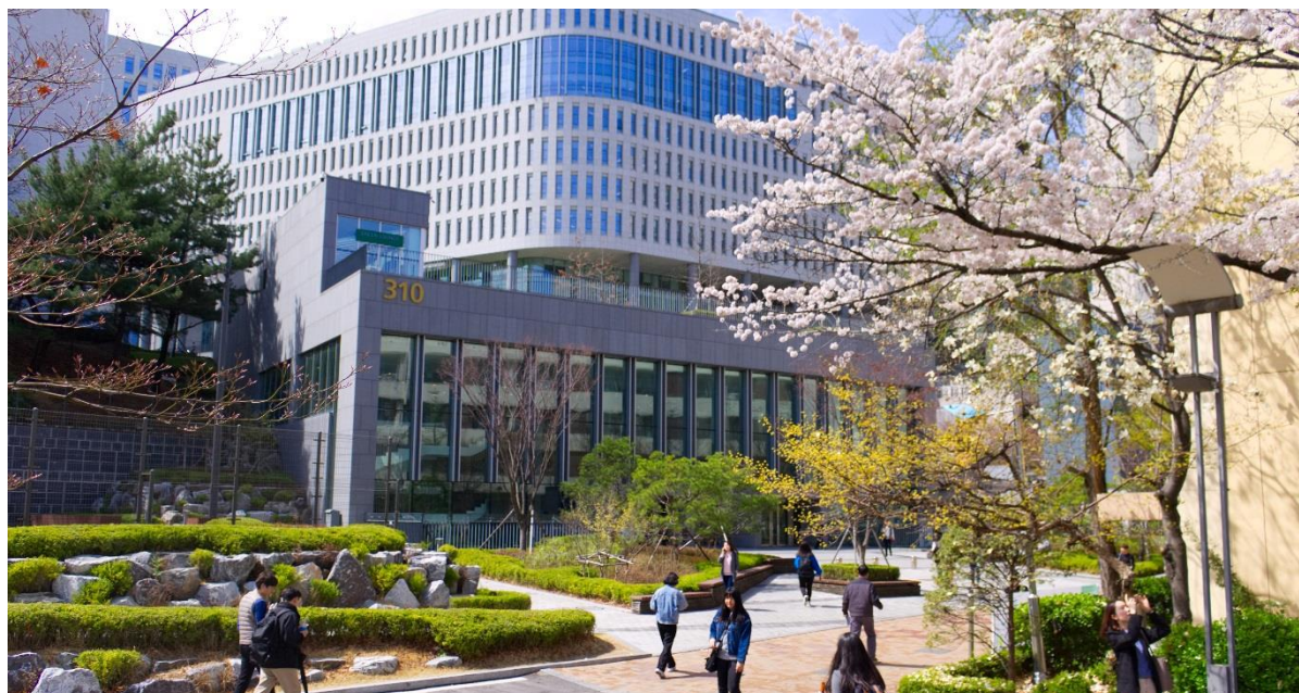
Centennial Building (Bldg. #310)