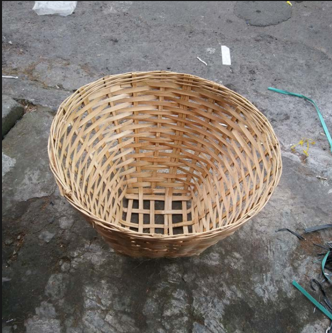
Small trash can