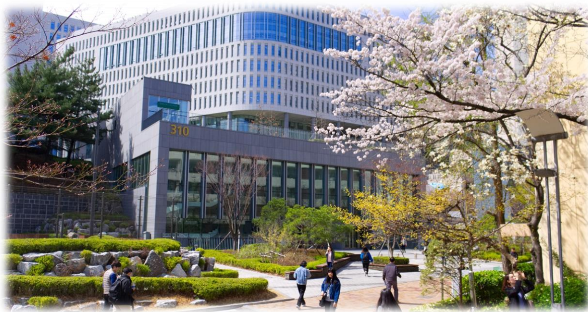
Centennial Building (Bldg. #310)