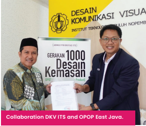
Collaboration DKV ITS and OPOP East Java.