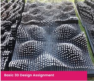
Basic 3D Design Assignment