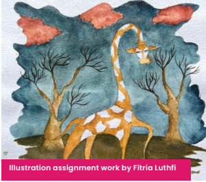
Illustration assignment work by Fitriia Luthfi