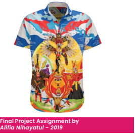
Final Project Assignment by Alifia Nihayatul - 2019