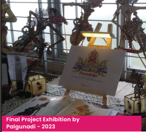
Final Project Exhibition by Paigunadi - 2023