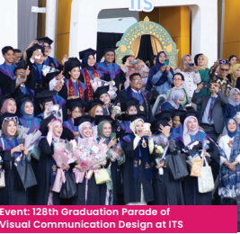
Event: 128th Graduation Parade of Visual Communication Design at ITS