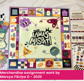
Merchandise assignment work by Marsya Fikriya D - 2020