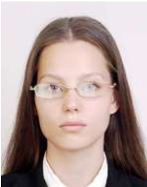
The light is reflecting off the glasses