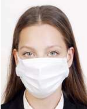
A mask covers part of the face