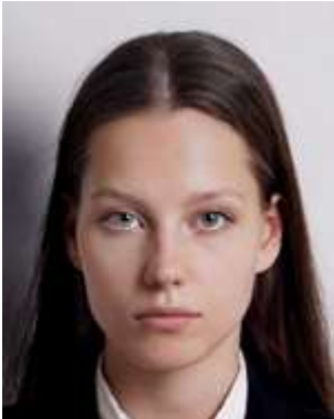
There is a shadow in the background