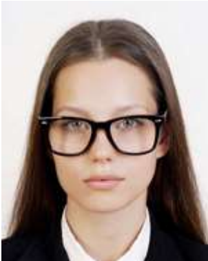
The frames of the glasses are very thick