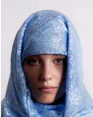
The face is covered with cloth and casts a shadow

(Note) It is acceptable for your face to be covered with a cloth or other material as long as it is clearly visible.If you are covering your face with a cloth or other material for religious or medical reasons, we ask that you submit a statement (optional form).