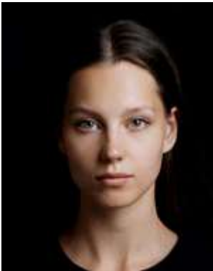
The background is dark, making it difficult to identify the outline.