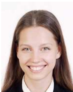
Significantly different from normal facial expression