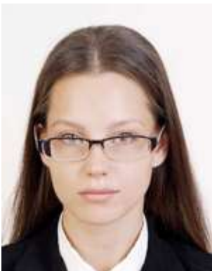
The frames of my glasses are hanging over my eyes