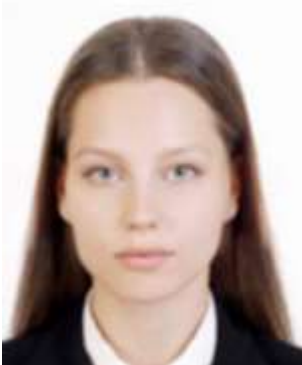
Blurred due to out of focus or camera shake