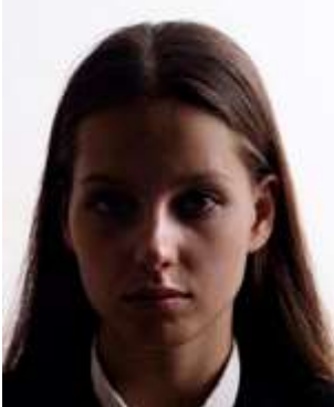
There is a shadow on the face

* In addition, it is inappropriate under any circumstances to change the image of the person by editing or processing the image to make the eyes look larger, whitening the skin, or modifying facial features, moles, wrinkles, etc. Also, photos that are reversed horizontally are inappropriate.